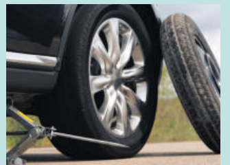
타이어 결함 Defective Tires