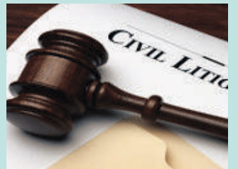
민사 소송 Civil Litigation