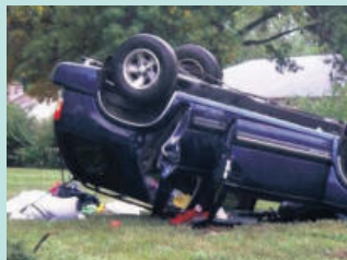
지붕파손 / 차량전복 Roof Crush / Roll Overs