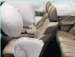
에어백 결함 Defective Airbags