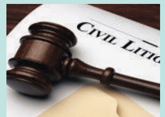
민사 소송 Civil Litigation