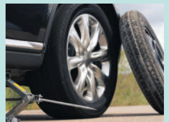
타이어 결함 Defective Tires