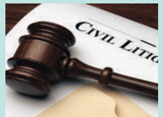
민사 소송 Civil Litigation