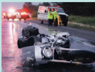
오토바이 사고 Motorcycle Accidents