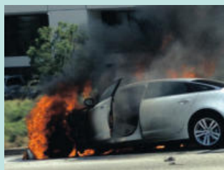
차량 화재 Car Fires