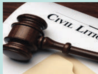
민사 소송 Civil Litigation