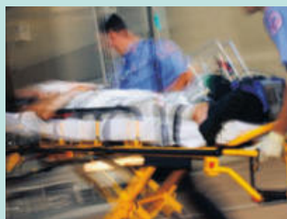
심각한 부상 Serious Injuries