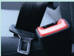
안전벨트 결함 Defective Seatbelts