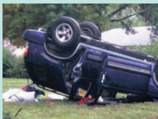
지붕파손 / 차량전복 Roof Crush / Roll Overs