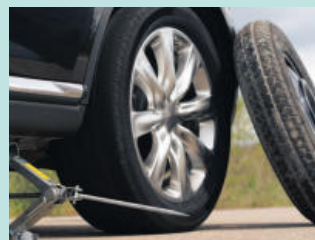
타이어 결함 Defective Tires