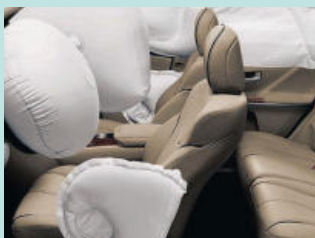
에어백 결함 Defective Airbags